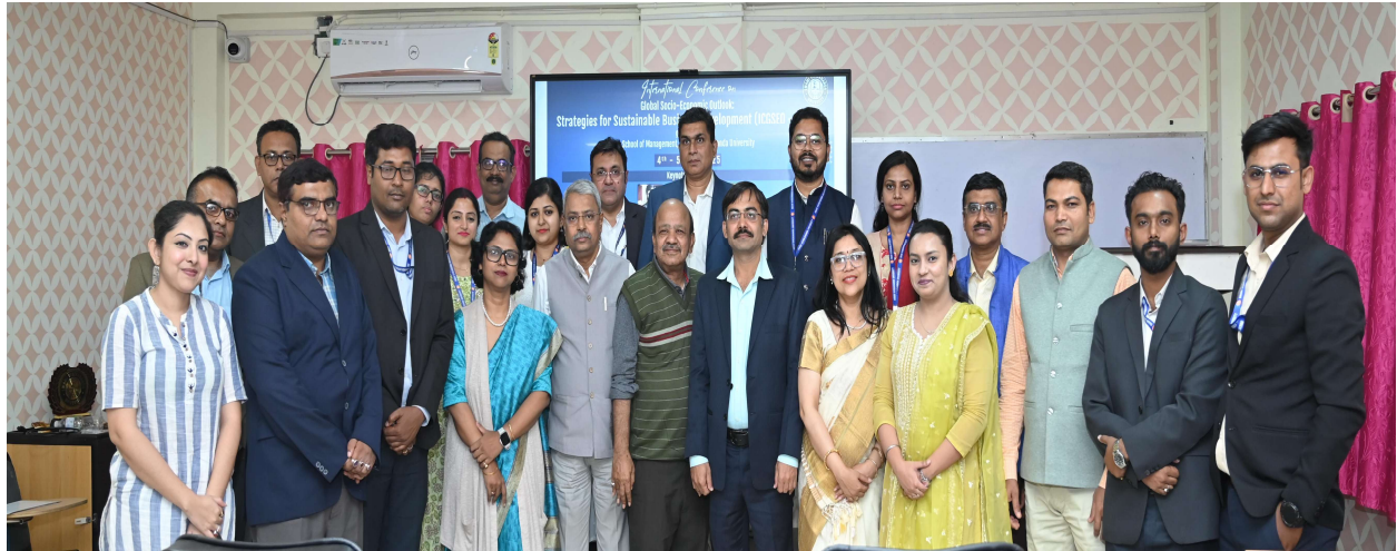
School of Management faculty members with Directors and Chief Guests in the closing ceremony